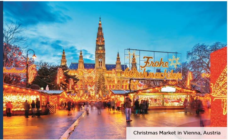
Christmas Market in Vienna, Austria

7-night cruise from Budapest to Nuremberg December 13-20, 2025 | AmaMora